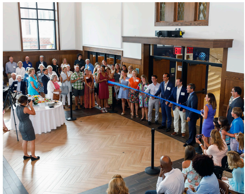
Members of the families whose significant contributions to—and leadership within—the campaign were invited to cut the ribbon in the Jack Olson '67 Commons to symbolize the opening of all of the new and renovated spaces. The dedication ceremony was attended by many members of the USM community.